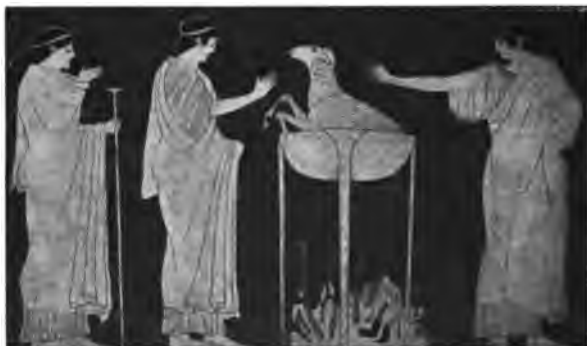
Fig. 86. Medea preparing the magic brew.

About the course followed by the Argonauts on their return voyage there is much uncertainty, but they seem to have met with many of the monsters and strange beings that Odysseus (or Ulysses) afterwards encountered. At last, however, they landed on their native shores and were